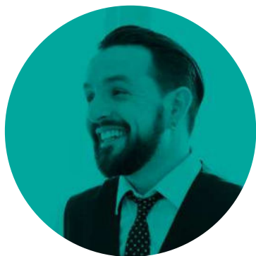
Founder of Modern Vocal Training Director of Modern Vocal Training Curriculum Director – Level 1