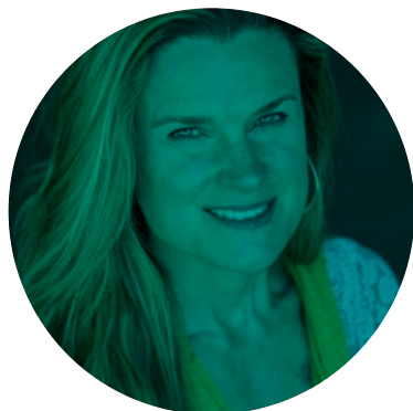
Director of Modern Vocal Training Curriculum Director – Level 2