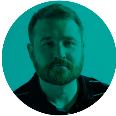
Director of Modern Vocal Training Curriculum Director – Level 3